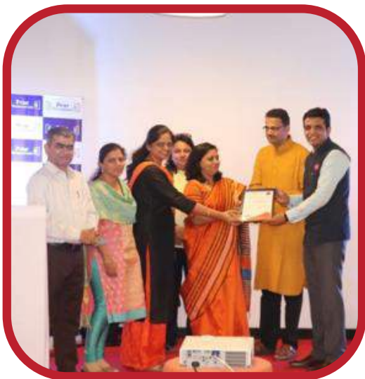
SAKEC WAS AWARDED ACADEMY OF YEAR 2019 AT PRIAR TECHNOWORLD RHA MEET & GREET 2019

The department conducted several events for students to introduce them to the Linux certification course for "Red Hat Certified System Administrator(RHCSE)" & "Red Hat Certified Engineer(RHCE)". These events mainly involve awareness sessions for TE, BE students and parents. The course is designed for 80 hours. 21 students had registered and successfully completed the course.