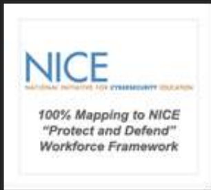
The National Initiative for Cybersecurity Education (NICE)